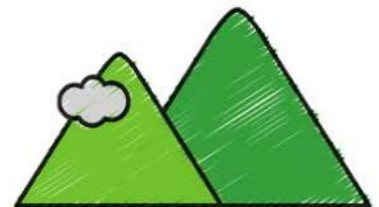
Sierra-Cascades Yearly Meeting of Friends

There you have it! I found it life-giving to be with a group that clearly puts people and relationships foremost in their decisions [in distributing time and financial support] as we follow Christ together.