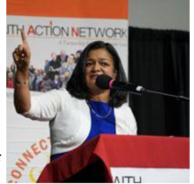
Congresswoman Pramila Jayapal

Congresswoman Jayapal spoke words of thanks for all gathered and Faith Action Network: "Thank you for your strength in blowing forth the winds of change, from ripples to waves. And thank you for your moral certitude in difficult times. We will win!"